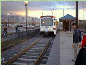
TRAX Salt Lake City, Utah

Community input is vital to creating a transportation solution that fits within the context of South Davis and Salt Lake County. We look forward to hearing your comments.