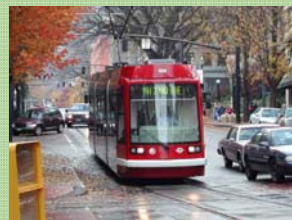
Streetcar Portland, Oregon